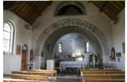
Church of Our Lady, Lampeter